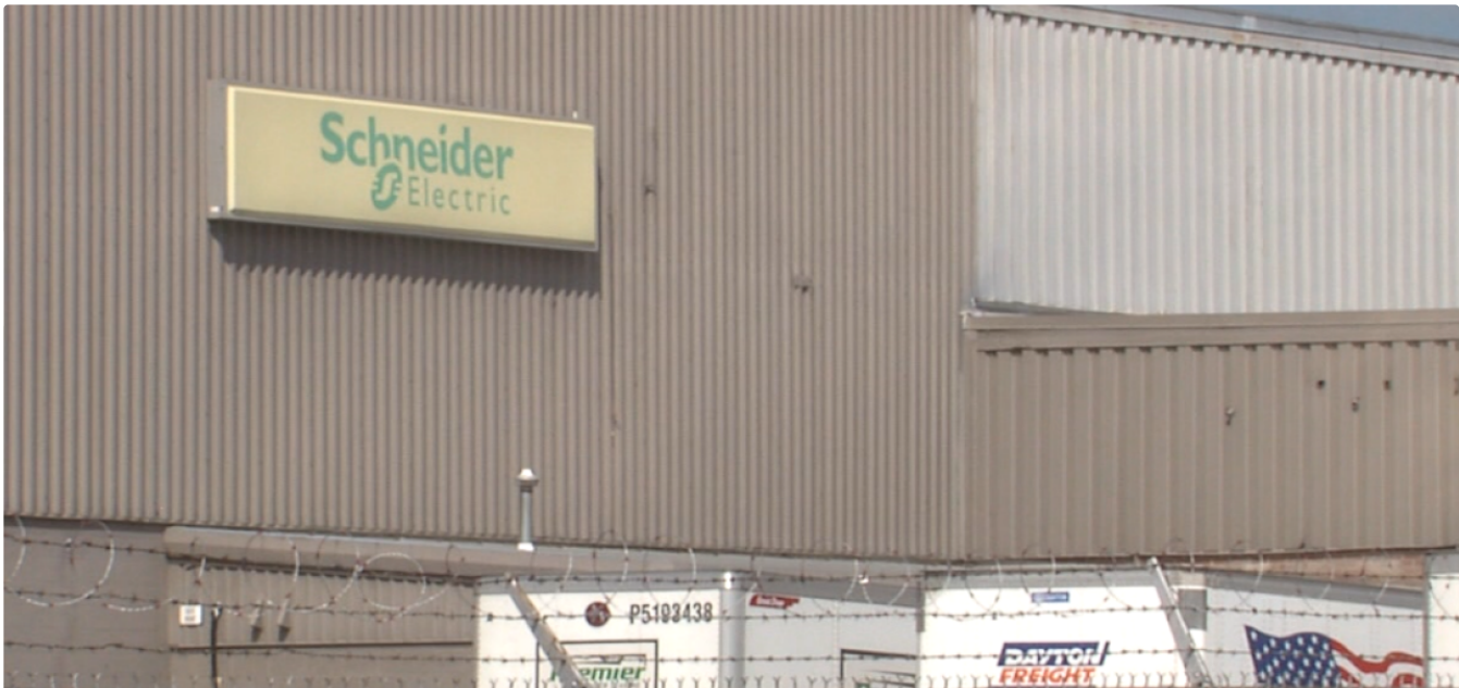
Copyright 2019 Scripps Media, Inc. All rights reserved. This material may not be published, broadcast, rewritten, or redistributed.