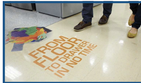
Floor Graphics - Ballroom Level