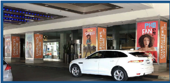
Main Entrance Columns